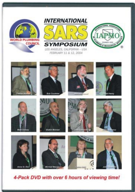
The WPC/IAPMO SARS Symposium DVD set

The DVD can be purchased for US$35.00 via the IAPMO website, www.iapmo.org