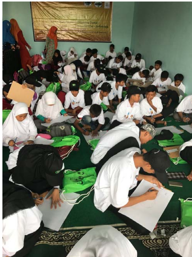
Children in Indonesia participating in the poster contest.