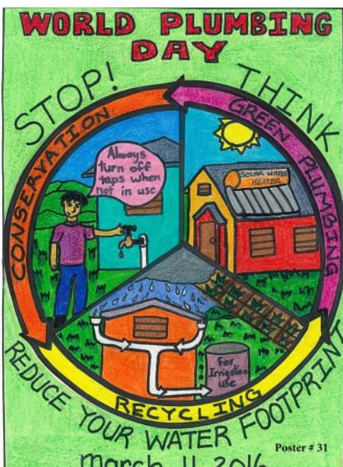
"Reduce your water footprint" was the theme of Neil Graham's second place poster