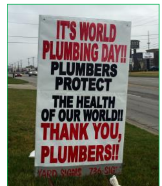
Carter Plumbing of Indiana, USA promoted World Plumbing Day by placing this sign in front of their business where 35,000 pass by everyday

British-based global distributor, Studor Ventech, made a donation to the Drop Dead foundation to support their valuable work in India repairing minor plumbing problems such as leaking taps, at no charge to consumers.