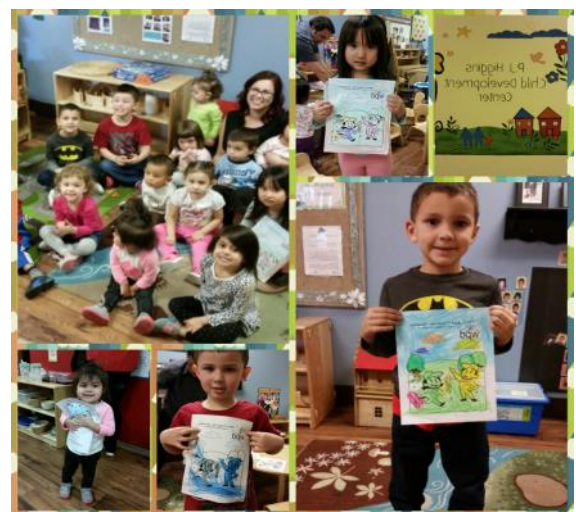
IAPMO Group employees' children celebrating World Plumbing Day in the USA