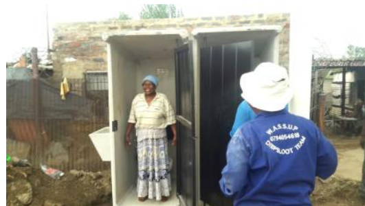
WASSUP at work