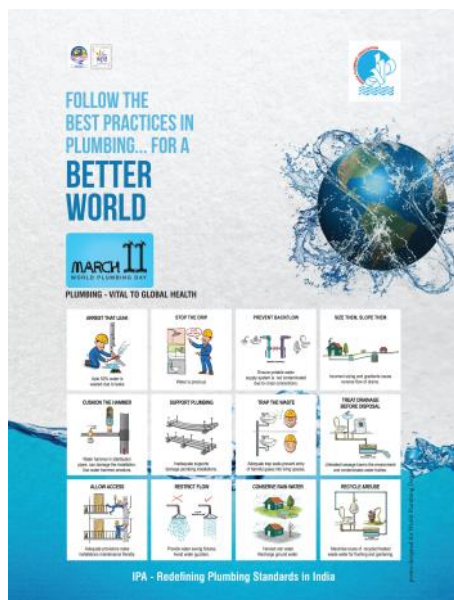
The Indian Plumbing Association produced this poster to support World Plumbing Day