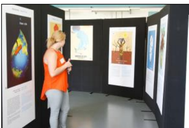
PICAC presented the Water is Life Exhibition, on behalf of ZVSHK alongside its WPD key industry forum

In Victoria, the Plumbing Industry Climate Action Centre (PICAC) hosted a key industry forum opened by the Lord Mayor of Melbourne, the Right Honourable Robert Doyle. In his opening address, the Lord Mayor praised PICAC's technology, skills and environment focus, designed to keep the State's plumbers abreast of the latest plumbing technologies to ensure the city of Melbourne retains its mantle as a world leader in water sustainability and conservation.