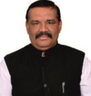
Hon. Vijay Sampla

At the IPA Japur Chapter a painting competition for primary school children was held at three nearby schools: Seth Anandi Lal Poddar Institute Of Deaf Dumb & Blind at Trimurthi Circle, Vimukti Girls School for deprived girls (typically from slum villages), Shanti Path and the Jaipur and Govt. School at Behlod village, Jaipur.