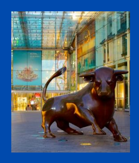
Bullring & Grand Central Shopping centre Birmingham